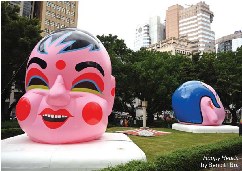
Happy Heads by Benoit+Bo.

The party wraps up with the 2019! Outloud Street Art festival, where an international group of street artists will be arriving in Macau to add their colorful creative touch to the city with a large, graffiti wall-painting sessions. There will be workshops with the artists, along with music, dancing and plenty to eat. Call it a celebration for all senses. +