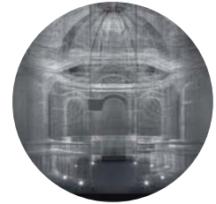
EDOARDO TRESOLDI Italy

Tresoldi plays with the balance of time, space and dimensions referencing Renaissance masters and classical architecture. Forbes named him one of the 30 Most Influential European Artists Under 30 in 2017.