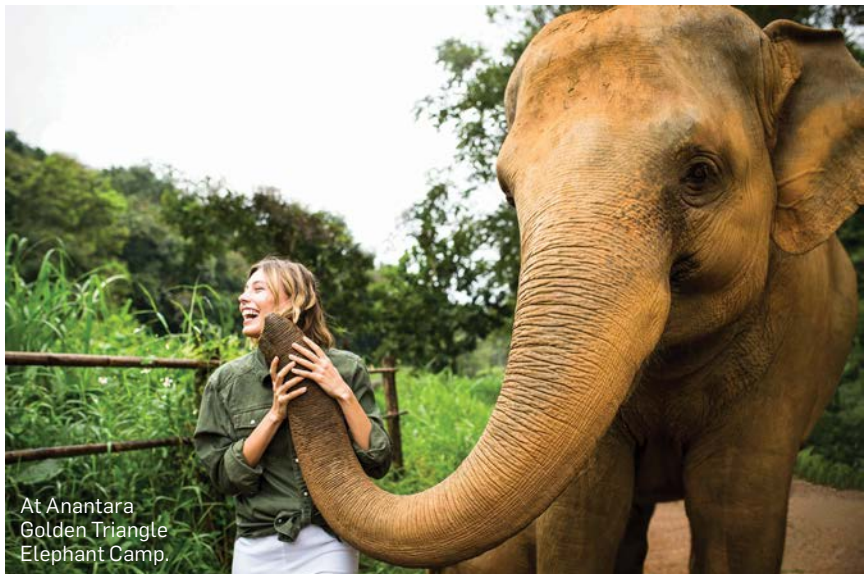
At Anantara Golden Triangle Elephant Camp.

On March 13, Anantara Golden Triangle Elephant Camp & Resort in Chiang Rai will host a fête, market and elephant walks. Then, in Bangkok on the weekend of March 29–31, dragon-boat racing teams will descend on the Chao Phraya River for a regatta in special boats adorned with wooden elephant heads. Ashore, join a dry-dock rowing competition, or enjoy an Old Siam-themed Ladies Day, concerts, champagne tents and more. bangkokriverfestival.com ; tickets Bt200 per person, per day; VIP tickets Bt3,000 per person, per day, including free-flow drinks and snacks. — E.B.