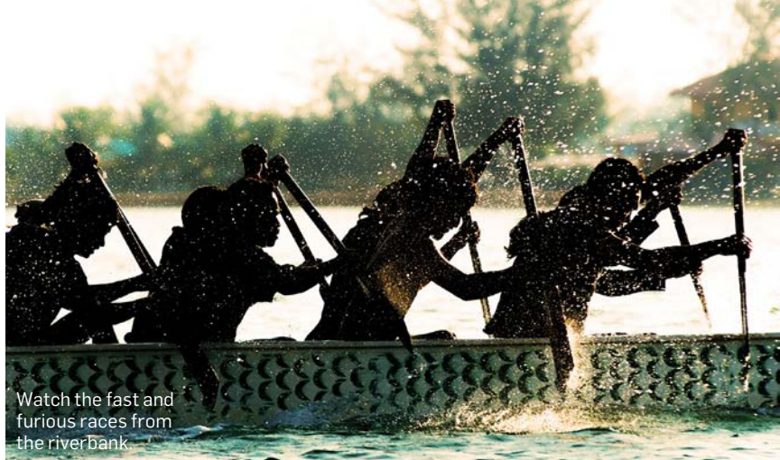
Watch the fast and furious races from the riverbank.

You may have noticed that Anantara has a thing for pachyderms. This month they're launching new parties in their honor, to raise money for the Golden Triangle Elephant Foundation, a non-profit that rescues the animals and provides housing, health care and insurance for the mahouts and their families.