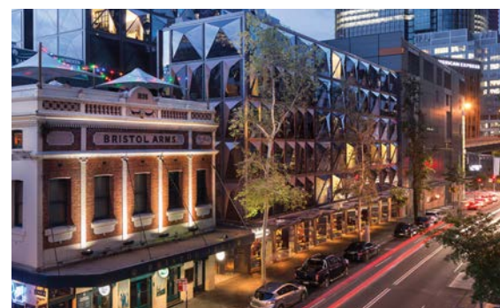
FROM TOP: The Collectionist's Pepo Melone room; West Hotel's gleaming exterior.