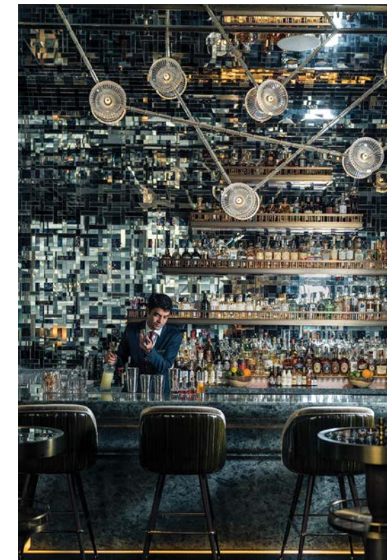
Four Seasons' cocktail den, Bar Trigona.