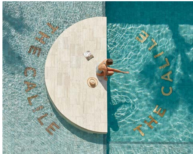
CLOCKWISE FROM TOP LEFT: All skyline, all the time at Banyan Tree Kuala Lumpur; a new home for Singapore's Stolen boutique; the fig and walnut Machine Gun Jack from Manila bar The Back Room; Brisbane's new urban resort, The Calile; a splash of color in Bali with beach club Tropicola; boutique Paramount House Hotel in Sydney; Wagyu, Peruvian-style at Ichu, Hong Kong; pro cocktails at the new SugarSand beach bar at Hotel Indigo Bali.